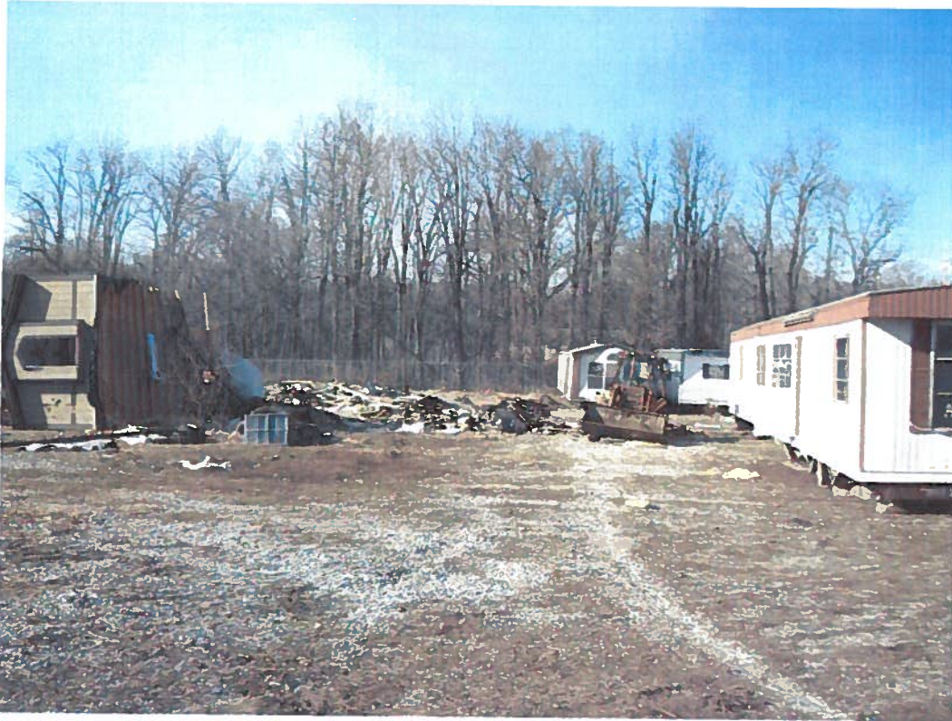
Date: 01/09/2012 Time: 10:47 a.m. Direction: west Exposure #: 001 Comments: demolition debris