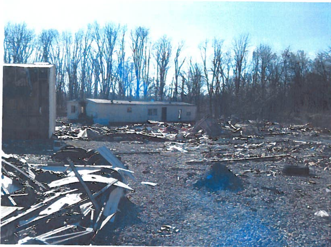
Date: 01/09/2012 Time: 10:49 a.m. Direction: south Exposure #: 005 Comments: demolition debris