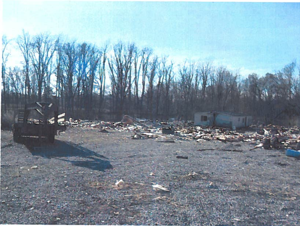
Date: 01/09/2012 Time: 10:47 a.m. Direction: southwest Exposure #: 003 Comments: demolition debris