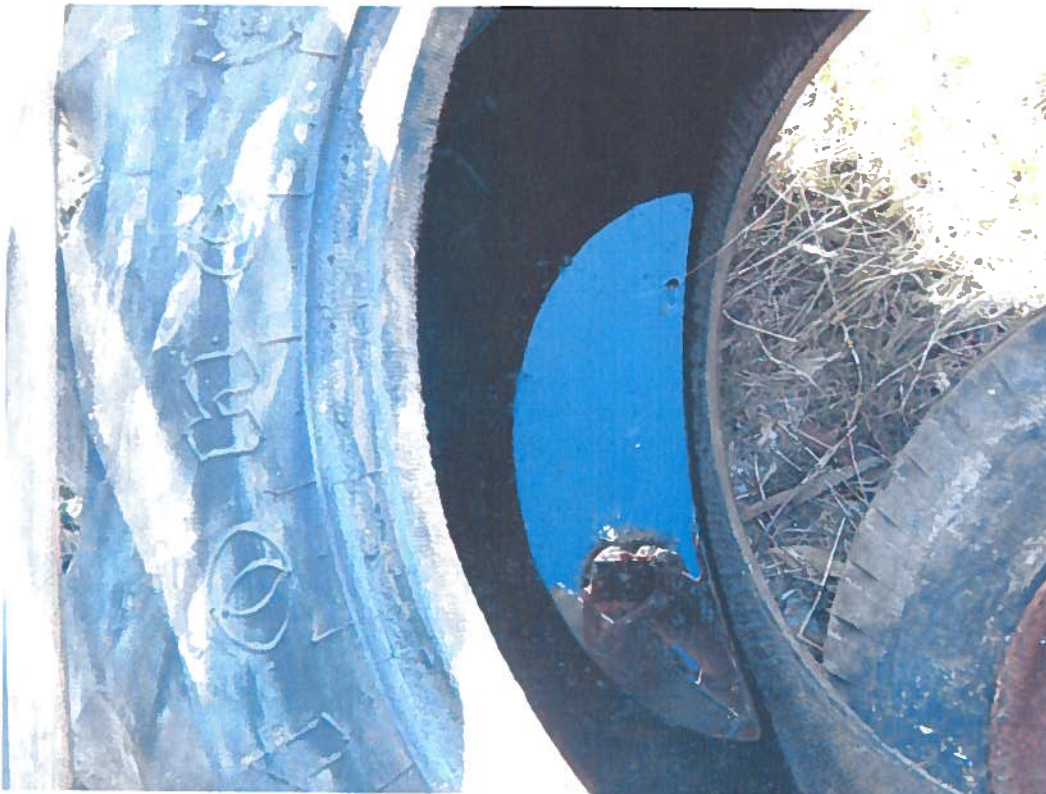
Date: 01/09/2012 Time: 10:48 a.m. Direction: down Exposure #: 004 Comments: water in tires

File Names: 0818105002~01092012-[Exp. #].jpg