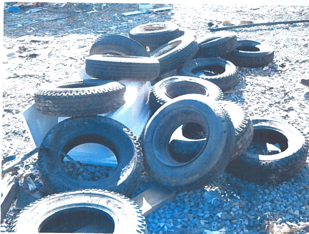
Date: 01/09/2012 Time: 10:49 a.m. Direction: south Exposure #: 006 Comments: waste tires

File Names: 0818105002~01092012-[Exp. #].jpg