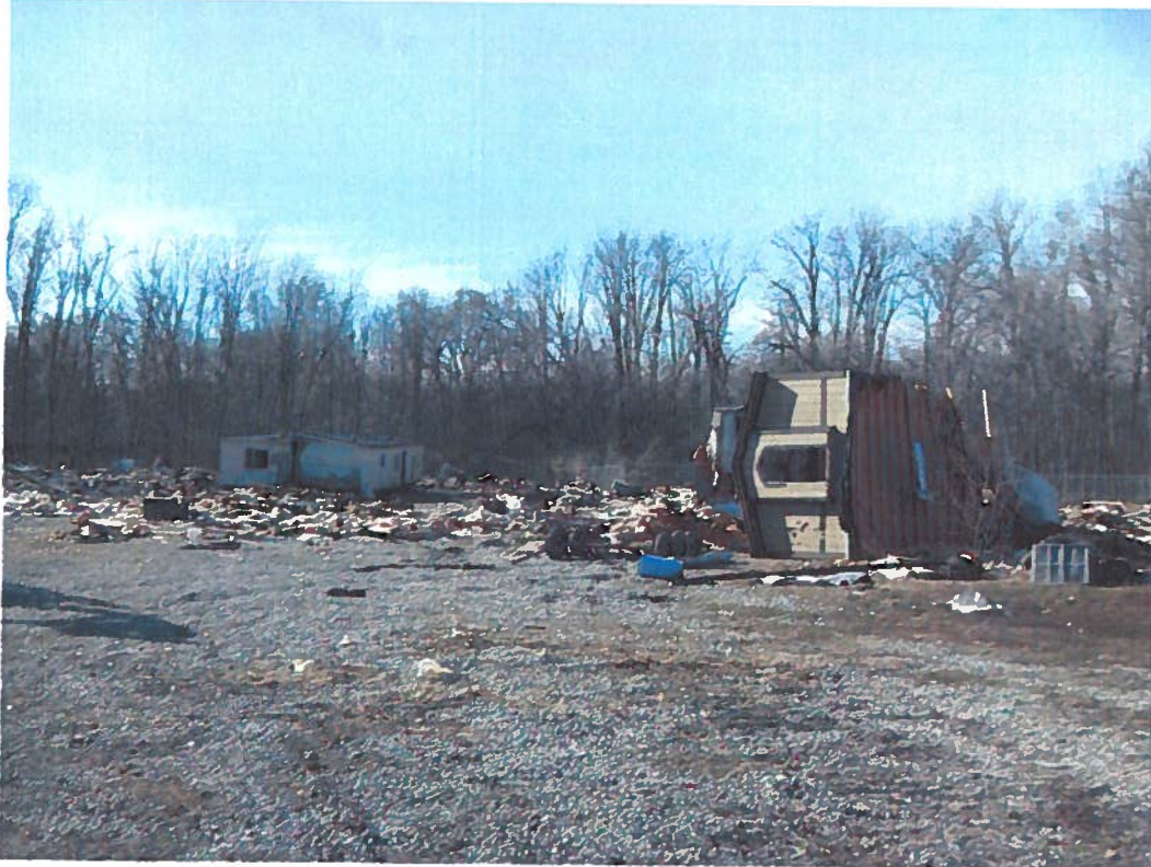
Date: 01/09/2012 Time: 10:47 a.m. Direction: southwest Exposure #: 002 Comments: demolition debris

File Names: 0818105002~01092012-[Exp. #].jpg